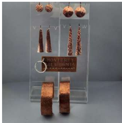
Photo of Samples to Make at The Summer Fun Workshop

https://www.facebook.com/AromasHillsArtisans/