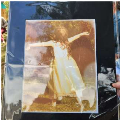
Hi from Irene Hoye Celebrate Nature Photography