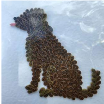
Hi from Louise Coombes Celebrate Nature Paper Quilling