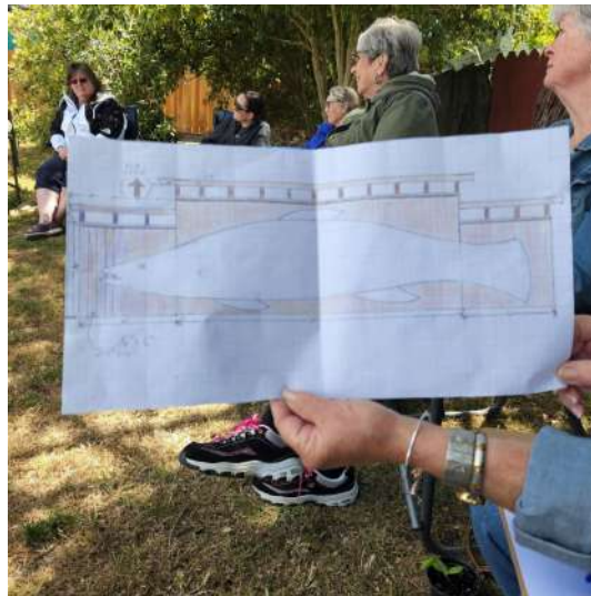
Layout for the New Fish instillation at Aromas Town Square Park